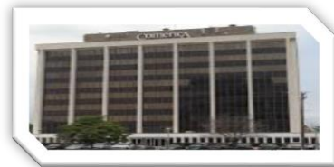
Warren – Macomb County